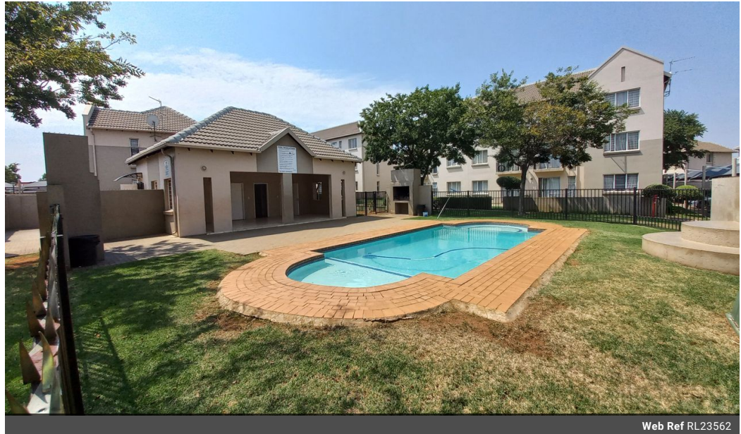
Web Ref RL23562