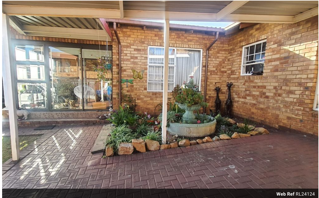
Web Ref RL24124