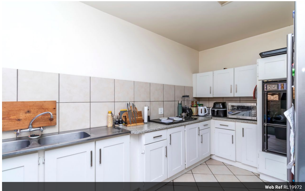
Web Ref RL19972

34 6th Street Parkhurst Johannesburg 2193