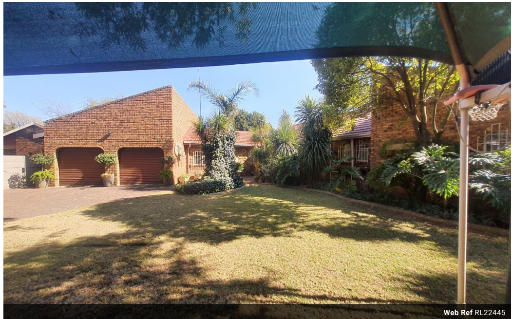
Web Ref RL22445