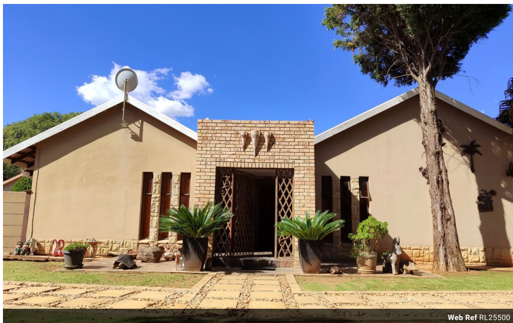
Web Ref RL25500

59 Monica Avenue Flamwood Klerksdorp 2571